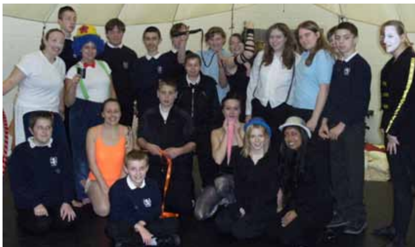
Pupils from the Learning Support Centre enjoyed a performance given by drama students at the University.