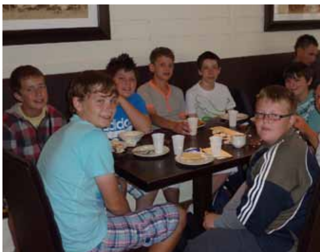
Geography Pupils on the Olympic trip in London.