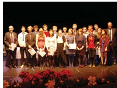
A Level Prizewinners.