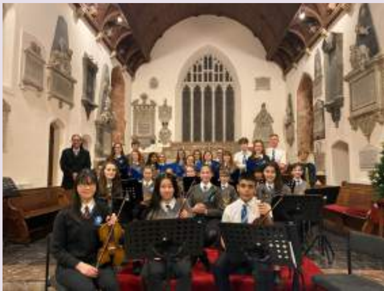
A (belated) Merry Christmas from the music department! A photo taken in Llanbadarn Fawr Church, immediately prior to the 2019 'Penglais Carols & Candles' service.