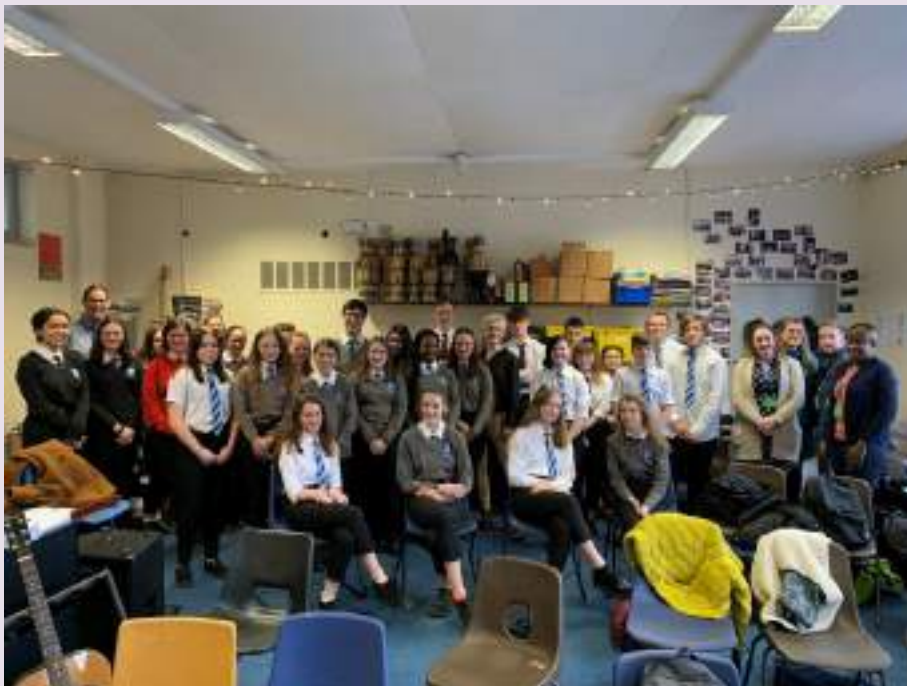
A photo from the 'Talking Shop' workshop with Catrin Finch on Wednesday 29 th February.

Catrin also told us that she is performing at the Glastonbury Festival this year! It was a pleasure to have her in the department, and some students were able to get photos/signed items from her etc. A few of us also enjoyed her concert that evening, in the Aberystwyth Arts Centre – a memorable day.